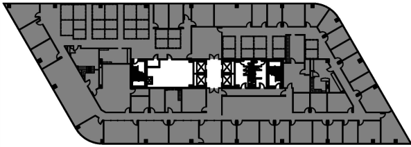
SUITE 600 RSF - 20,941